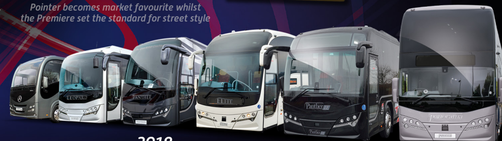
2018 Leading the way with Cheetah XL, Leopard, Panther, Elite, and the new Panorama double deck