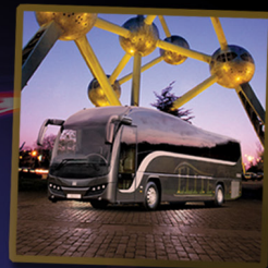
2008 Elite launched reaching new levels of style and aerodynamic efficiency