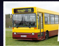
1991 Pointer becomes market favourite whilst the Premiere set the standard for street style