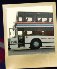
1982 Paramount evolves to offer a unique, high capacity, double deck variant