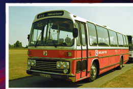
1974 Supreme launched featuring an all-steel construction