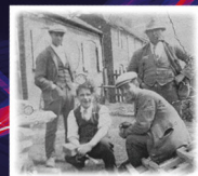
1907 Plaxton founded

All British built to last with stainless steel body structures. All backed by outstanding after sales support. All designed to be adaptable as your needs change for best-in-class whole life costs. Add superb resale values, and it's easy to see why operators continue to choose Plaxton.