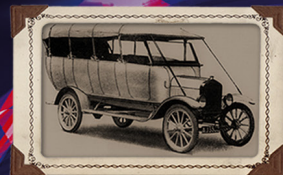
1919 Plaxton Charabanc on Ford Model T chassis off the line