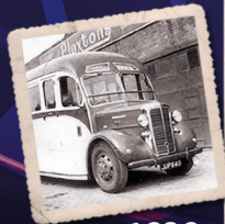
1939 Coach production stops while Plaxton helps with the war effort