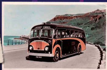
1958 Panorama launched. Plaxton becomes market leader by 1960's